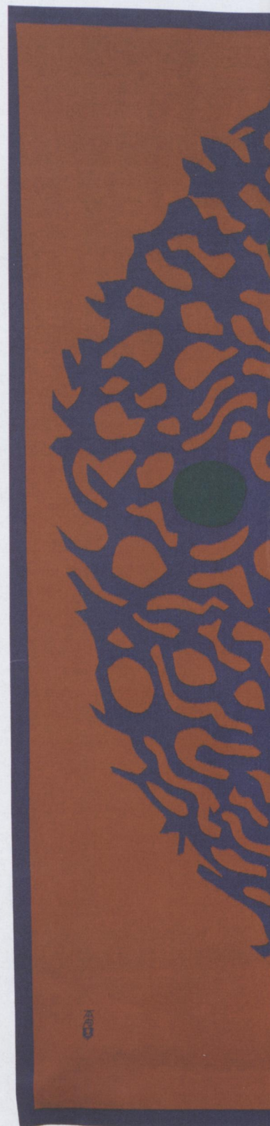
2 (Right) PATRICK SCOTT: Lansdowne , c.1971. Aubusson Tapestry: Atelier Tabard Frères & Soeurs. 219 x 265 cm. (Private Collection.)