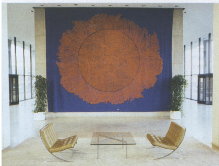
1 (Above) PATRICK SCOTT: Blaze , 1972. Woven wool tapestry on cotton warp. Aubusson Tapestry: Atelier Tabard Frères & Soeurs. 527 x 650 cm. (Bank of Ireland.)